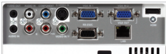
Includes a full complement of connections, including network control.

EIKI® is a registered trademark of EIKI International, Inc. Kensington® is a registered trademark of ACCO Brands Corporation.