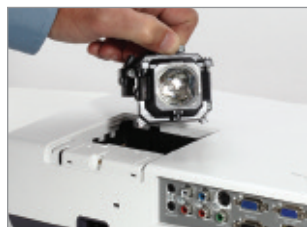
Easy to change long-life lamp.