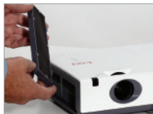
Handy access to air filter.