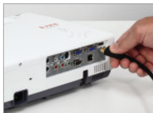
Just project and connect.