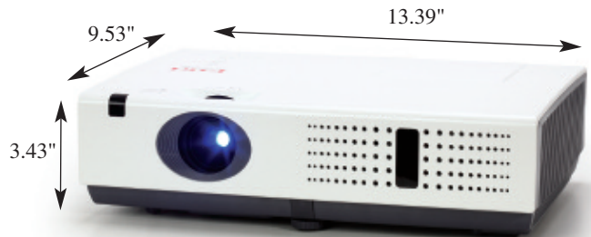
LC-XNS2600 / LC-XNS3100 • XGA projectors.